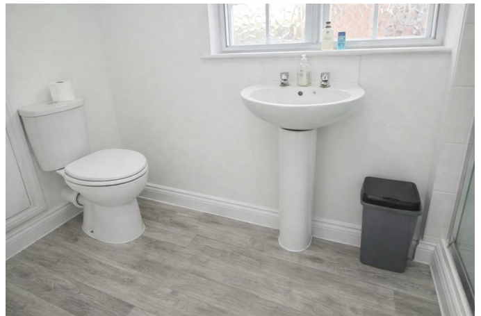
Bathroom 9'5" x 4'6" (2.87m x 1.37m)