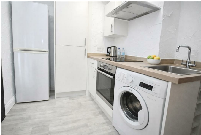
Kitchen 19'4" x 13'9" (5.89m x 4.19m )