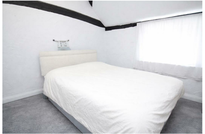
Bedroom 13'9" x 11'5" (4.19m x 3.48m)